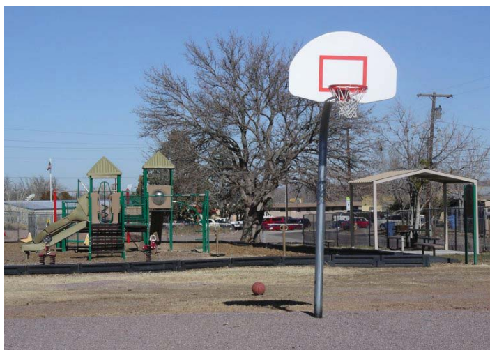
West Place Park.

South of the Cottonwood Charter School is another point of collaboration: the West Place Park. The basketball court was recently chip sealed, with Blue Collar Construction loaning equipment and labor, Holly Oil (in the form of Mo Moabed) donating the oil and the New Mexico State Highway department donating the use of the road roller to compact the chips. The City plans also to redo the sprinkler system and replace the ditch with a culvert to make access easier for classes from Cottonwood Charter School.