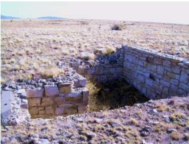
Remains of the old AT&SF station building. Likely, this was also the location of the first Post Office.