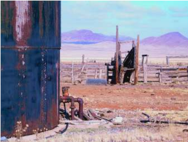
The water tank and stock pens at the AT&SF Water Canyon station. The flat swale between the tank and stock pens is the old railroad grade.