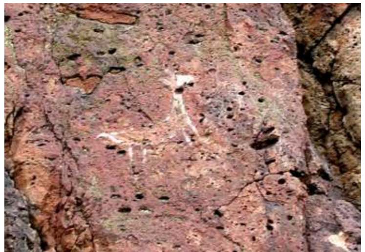
A pictograph of a horse at the old Indian "meeting place" near Council Rock, dating it after 1540 – when the Spanish brought the first horses into New Mexico.