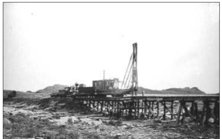
Building the Magdalena spur line. This bridge, spanning an arroyo west of the old Water Canyon station, is still visible north of U.S. 60.

During the early 1900s, new ranchers and small mining concerns caused the area to grow. A complex of homes