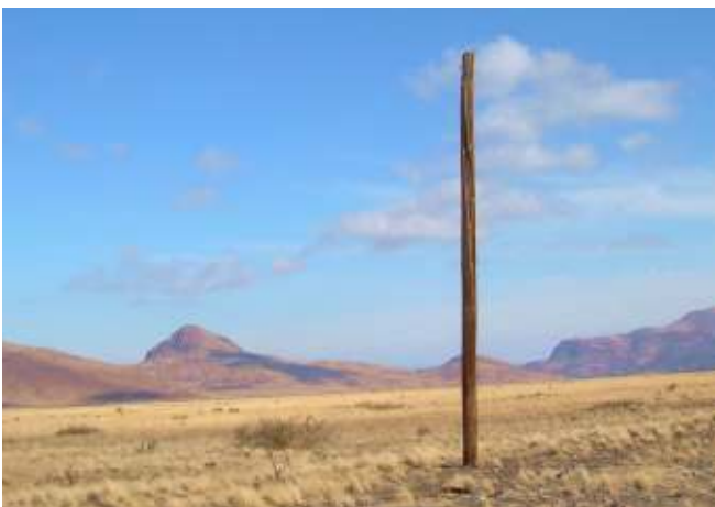
A few lonely telegraph poles still stand along the old railroad grade near Water Canyon.