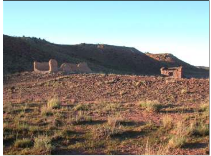
Puertocito as it appears today. The wider view shows the trading post (left) and the Anastacio Baca home.

buildings remaining. This archeological site is now on private property.